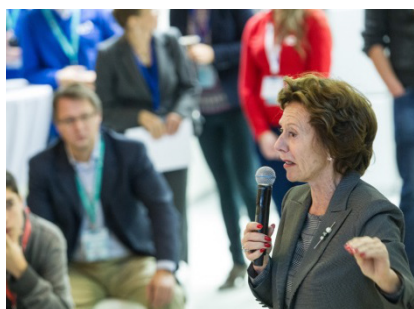
Neelie Kroes Vice-President of the European Commission speaking at ICT 2013.

"Take healthcare... the fact is that big data, suitably anonymised, can improve healthcare and save lives. So failing to act would also be a concern."